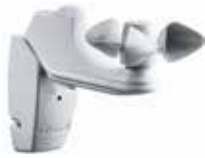
Wind Cup Exterior Plug-In or Hardwired