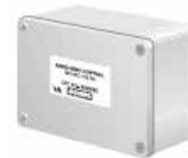
Universal Receiver Hardwired